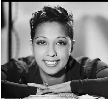
13 NOV: ON JOSEPHINE BAKER