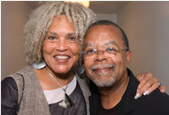
Charlayne Hunter-Gault and Director Gates just before the start of “Race [Still] Matters.”