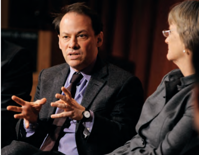
Adam Gopnik, author of Angels & Ages: How Lincoln and Darwin Invented the Mind of the Modern World .