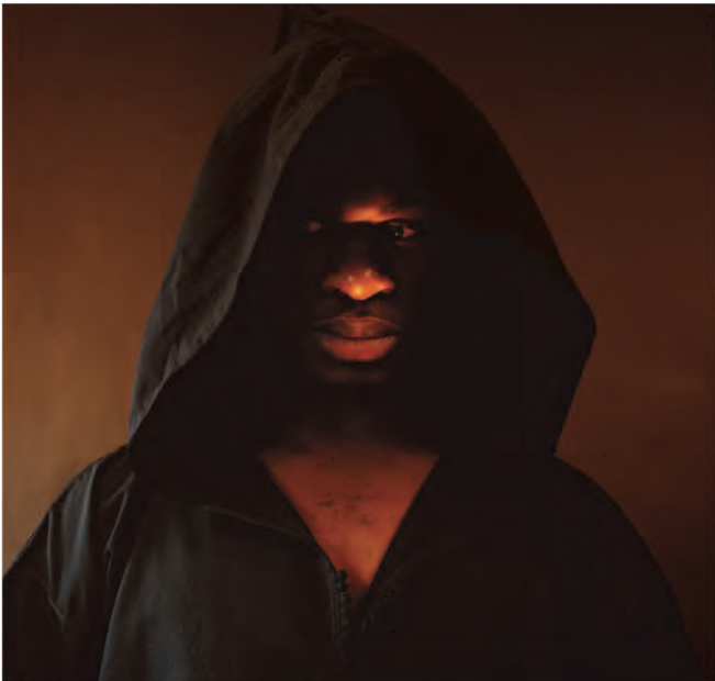
Rotimi Fani-Kayode, Black Friar, 1989.

On Three counts I am an outsider: in matters of sexuality; in terms of geographical and cultural dislocation; and in the sense of not having become the sort of respectably married professional my parents might have hoped for.