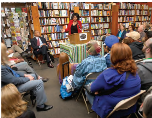
Rita Dove at the Harvard Book Store.

Hip-hop Archive at the W. E. B. Du Bois Institute