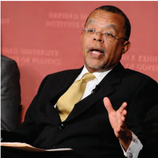
Henry Louis Gates, Jr., addressing a remark to the packed Kennedy Forum.