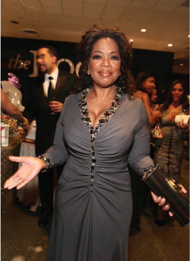
Oprah Winfrey at TheRoot Ball.