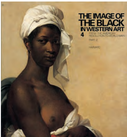
Cover images from the series of scholarly volumes produced by the Image of the Black in Western Art Research Project and Photo Archive.