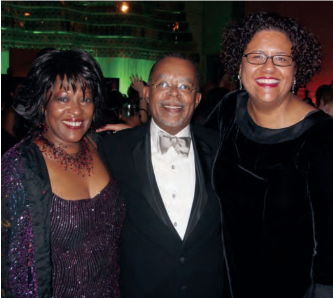
Rita Dove, Henry Louis Gates, Jr., and Elizabeth Alexander at the Fulbright Lifetime Achievement Award.