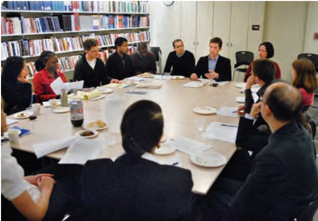
Andrew W. Kahr workshop on “Gold Coast Urban Crisis: Connecticut Beaches and the Transformation of Race and Rights, 1968-1975.”