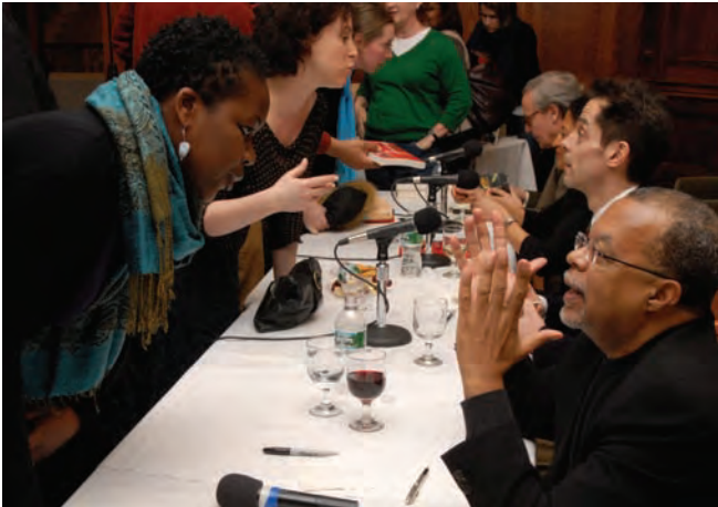
Book party autograph requests.