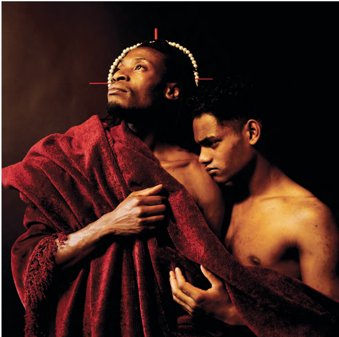
Ecstatic Antibodies: Every Moment Counts , 1989.