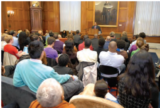
An overflowing Thompson Room is riveted by Michael Eric Dyson's lecture on the meaning of Barack Obama's election.