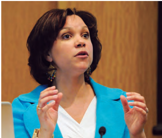
W. E. B. Du Bois Lecturer Melissa Harris-Lacewell.