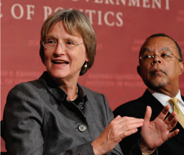
President Drew Gilpin Faust of Harvard University.