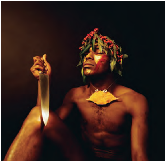
Bodies of Experience: Nothing to Lose XIII , 1989.

The exhibition marks the twentieth anniversary of Fani-Kayode's death. It reflects the mission of Autograph ABP's Archive and Research Centre for Culturally Diverse Photography at Rivington Place, London, which provided the information for this text.