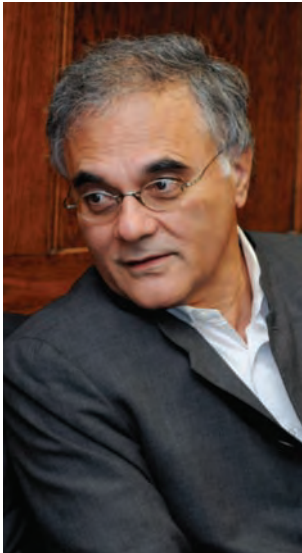
W. E. B. Du Bois Lecturer Mahmood Mamdani.