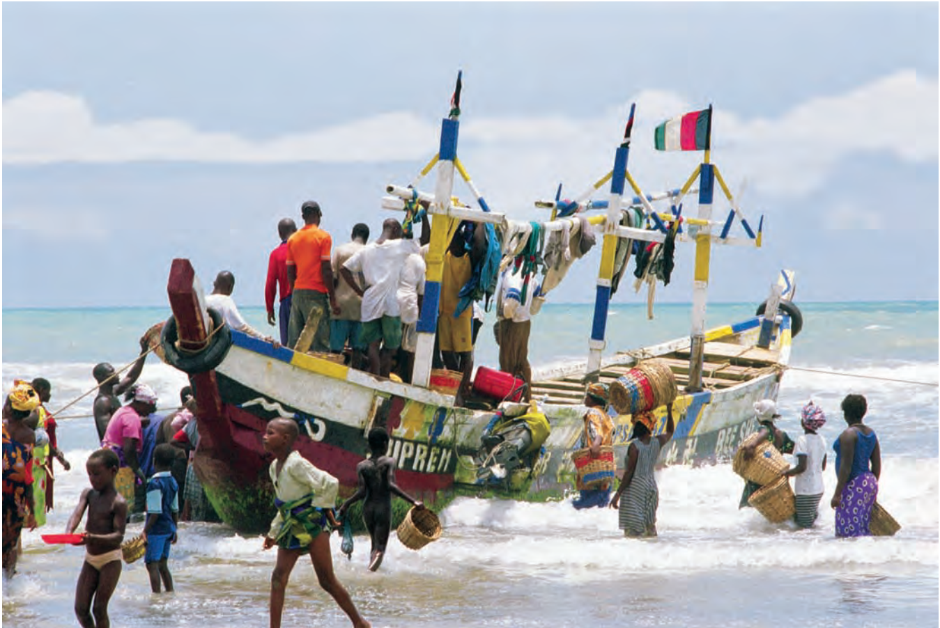
Lyle Ashton Harris, Untitled (Kokrobitey #3) 2008. Courtesy of the artist and CRG Gallery, New York.