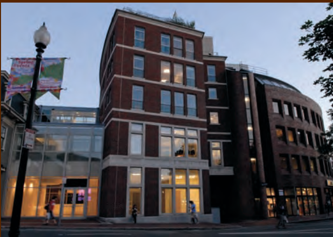
The main entrance to the W. E. B. Du Bois Institute for African and African American Research at 104 Mount Auburn Street, Cambridge, Massachusetts.