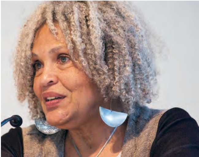
Charlayne Hunter-Gault served as moderator for "Race [Still] Matters."