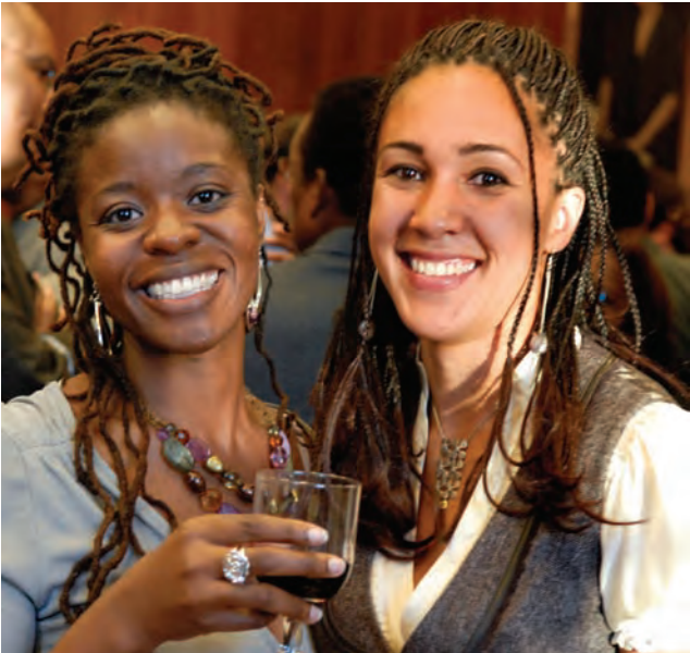
Fall 2008 welcoming party.