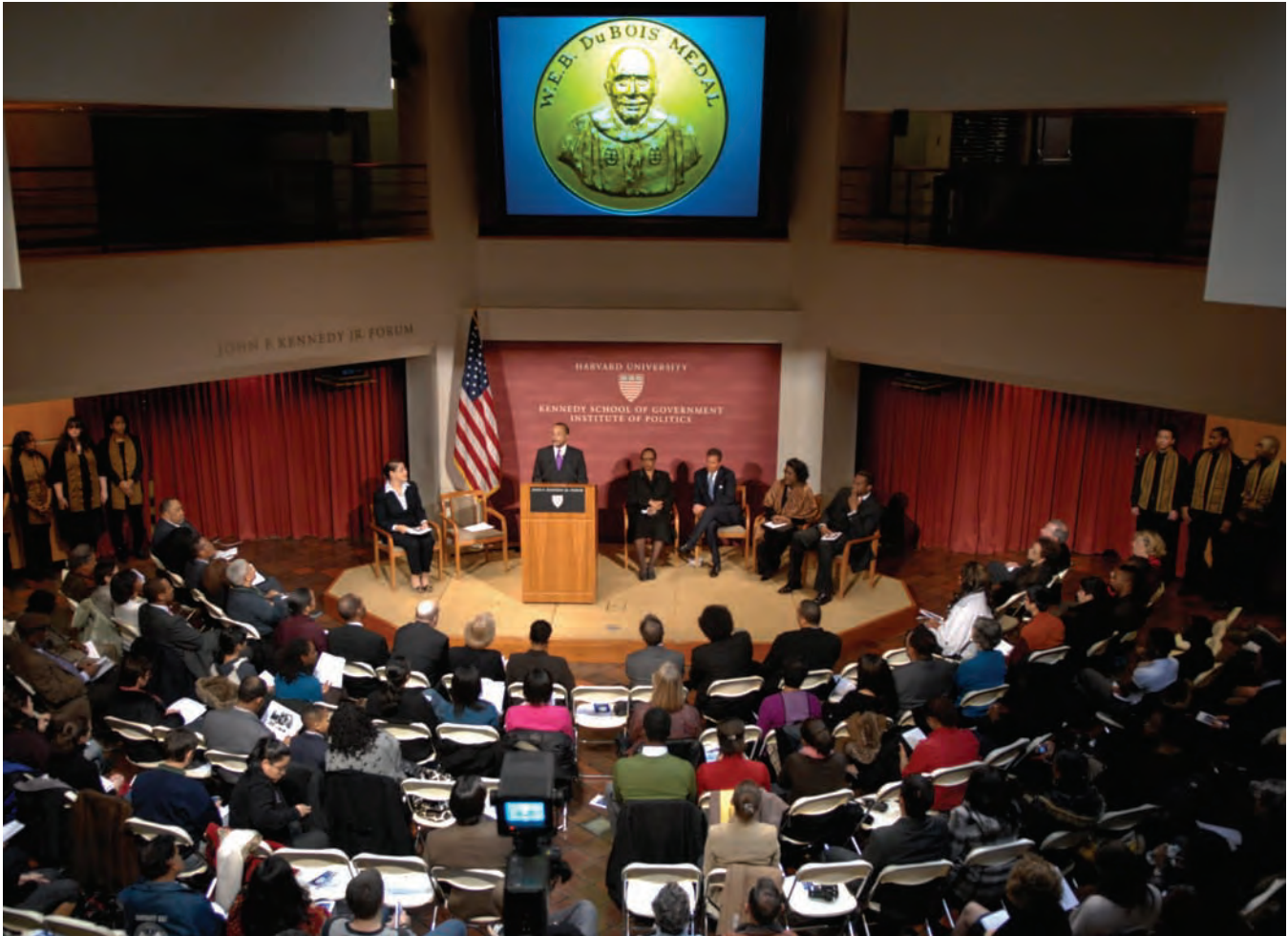
Du Bois Medal Event. The John F. Kennedy Jr. Forum, Institute of Politics, John F. Kennedy School of Government, Harvard University.