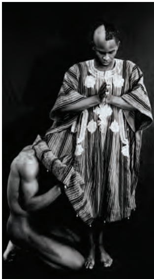
Under The Surplice , 1987.