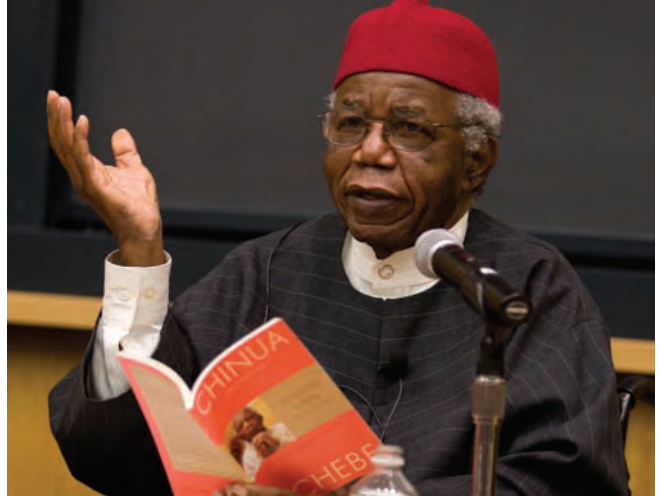
Chinua Achebe delivering his African Studies Distinguished Lecture.