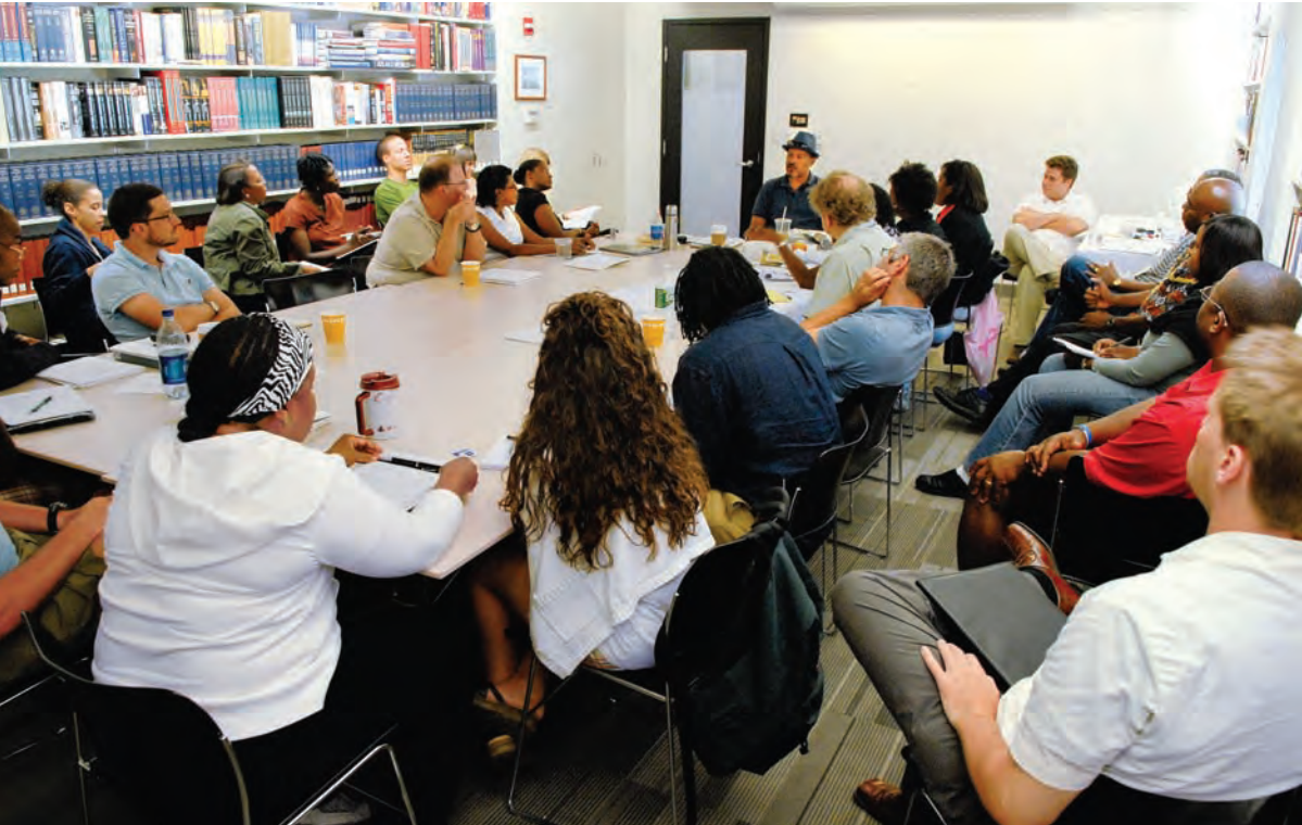
N.E.H. Summer Institute “African American Struggles for Civil Rights in the Twentieth Century” in the Hutchins Family Library.

AfricaMap, an open source website (available to any user anywhere), is an interactive site that will continue to grow over time. It is housed at Harvard’s Center for Geographic Analysis ( http://gis.harvard.edu/ ). The first (beta) phase of AfricaMap is now complete and was launched in November 2008. Additional information will be added in the months ahead, including images from museum collections, links to articles and books, a collection of maps stretching back to the sixteenth century, and historical layers showing political and other data through time. Eventually, users will have the ability to add information, comment on the findings of others, and to use the website as an online platform for collaborating with others. AfricaMap has begun to establish collaborations with an array of other institutions in order to display digitized