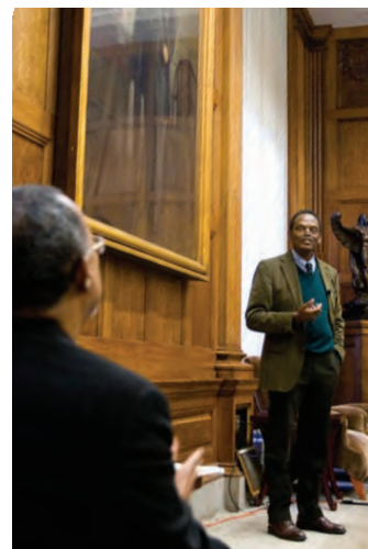
Professor William Julius Wilson responding to Director Gates during his Institute colloquium in the Thompson Room at the Barker Center.