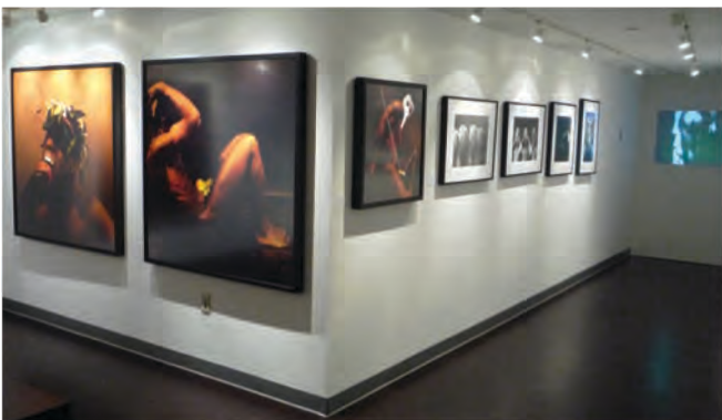
Installation view of Rotimi Fani-Kayode (1955–1989): Photographs, at the Rudenstine Gallery.