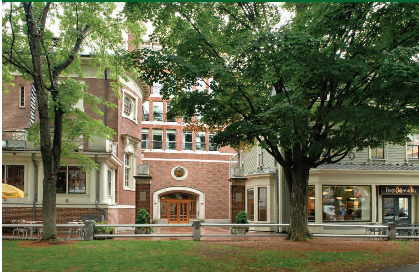
W. E. B. Du Bois Institute from Winthrop Park, along John F. Kennedy Street in Cambridge.

104 Mount Auburn Street, 3R Cambridge, MA 02138 617.495.8508 Phone 617.495.8511 Fax www.dubois.fas.harvard.edu