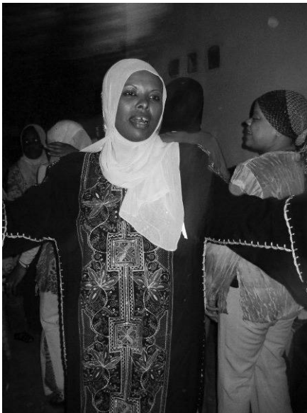
Woman dancing at the wedding, June 2009.

“Wait,” she grabs her scarf before the picture is taken, this one with me, and then a few additional ones with others at the shindig.